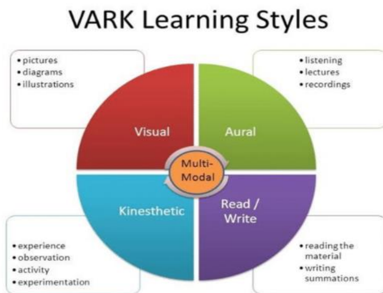
Fig. 2: VARK Learning Styles (12).

(listening), where learners learn better through listening and oral instruction, read-write, in which learners learn better by taking notes and reading written or printed texts, and kinesthetic style, where learners learn by doing practical, experimental examples and manipulating objects in a better physical process. The advantage of the VARK learning style is that it provides information about learning strategies and teaching methods and media appropriate to these styles (12).