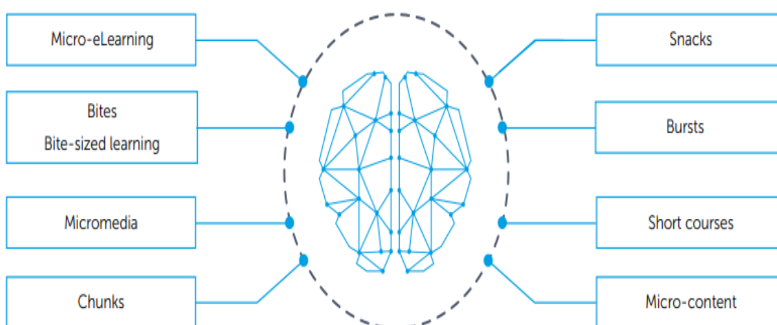
Fig.1: Synonyms of microlearning (22).

Microlearning has a 200-year history, summarized in Figure 2 (20, 22):